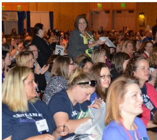
100th Annual WSPTA Convention