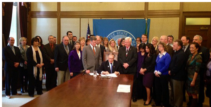
Governor Inslee signing the College and Career Ready Diploma into law -- a momentous, hard-won victory for Washington students!