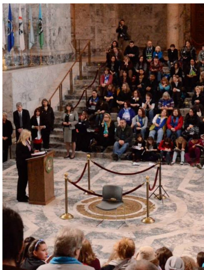
Focus Day 2014